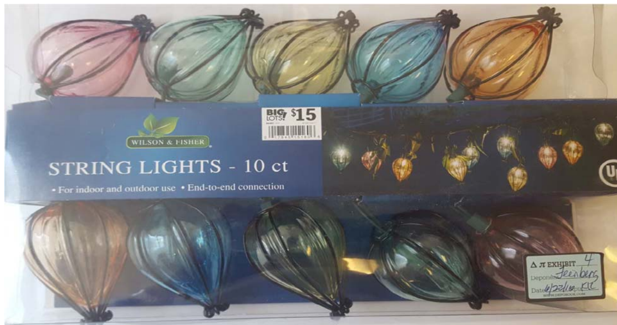
Advance Light Set

containing eight pieces of wire and they come together in a question mark form. (Def.'s 56.1 Resp. ¶ 67.) The Advance Light Set does not contain an ornamental dangly and the cover does not have an iridescent finish. (Pl.'s 56.1 Resp. ¶ 17.)