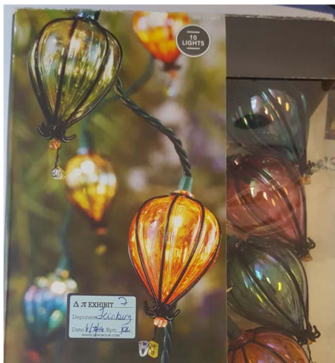
Tear Drop Light Set

Jetmax is a Hong Kong corporation that designs, manufactures, and sells a variety of furniture, lighting, and home décor items. (Defendants Response to [sic] Jetmax Limited’s Statement of Material Facts on Plaintiff’s Motion for Summary Judgment (“Defs.’ 56.1 Resp.”) ¶¶ 1, 20, ECF No. 45.) At the heart of the instant dispute is the Tear Drop Light Set, manufactured and offered for sale by Jetmax. ( Id. ¶ 32.) The Tear Drop Light set, as depicted below, is an ornamental light set comprised of a series of molded, decorative tear shaped covers with a wire frame over the covers.